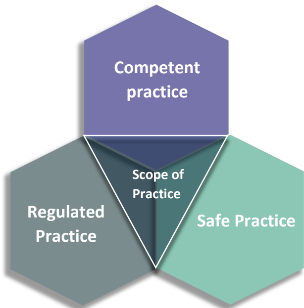
Diagram 1: Scope of Practice for Registered Counsellors

Consideration should be given to each facet for a complete view of counsellors' professional practice. In doing so, counsellors maintain the trust and confidence of clients and of the community. Trust and confidence are essential to the therapeutic relationship, and to the development of the counselling profession as a valued part of Australia's mental health system.